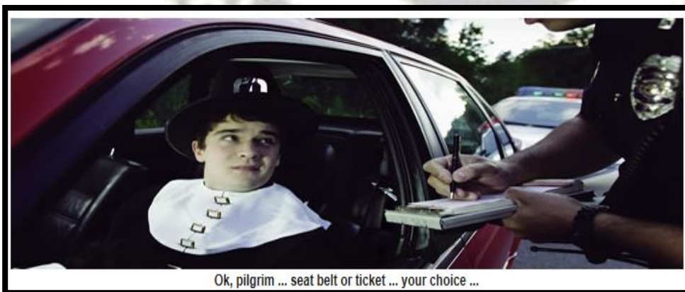
Ok, pilgrim ... seat belt or ticket ... your choice ...